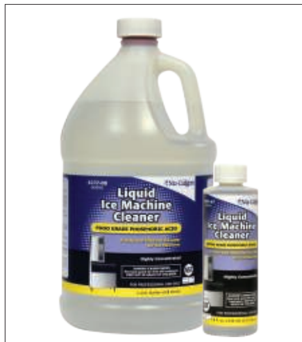
Liquid Ice Machine Cleaner