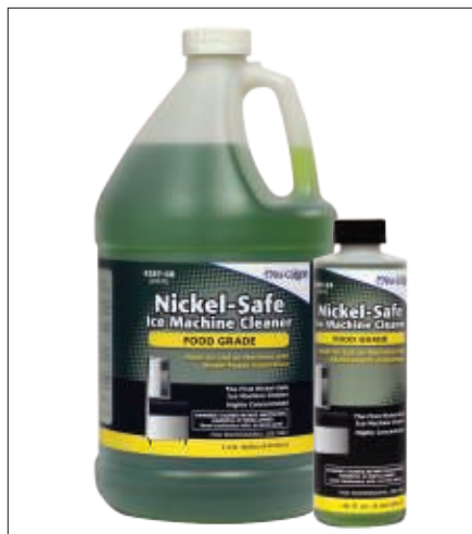
Nickel-Safe Ice Machine Cleaner

Nickel-Safe Ice Machine Cleaner is a specially formulated citric/phosphoric food-grade product for removing scale deposits from ice makers having nickel-plated or tin-plated evaporators. It is acceptable for use in machines made by Manitowoc and other manufacturers using nickel. In fact, it was the industry's first nickel-safe product, introduced in collaboration with Manitowoc. Usage rate should be in accordance with the manufacturers instructions or 16 fluid ounces with three gallons of system water.