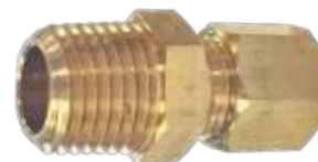
1/4" MPT x 1/4" compression fittings