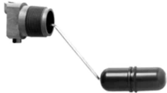
Figure 1: F93B Air Volume Control for Deep Wells

The F93H has a minimum pressure release valve to avoid lowering tank pressure below 25 psig (172 kPa). Use this model on applications where water may be rapidly drained.