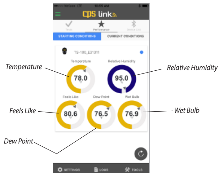
Data Displayed In Starting Conditions Screen