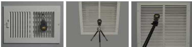
Suspend from grille