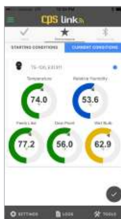
Current Conditions Screen

All Bluetooth Smart compatible Android phones & tablets with operating system 4.3 (Jelly Bean) or newer.