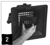
Low Volume Adapter