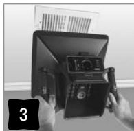
Capture airflow readings