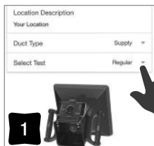
ABM EasyHood Main Screen