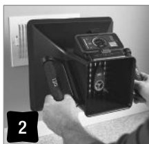
Capture Airflow Readings