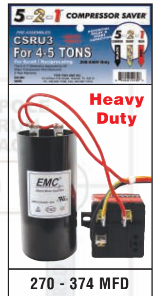
CSRU3 For 4-5 Tons For Scroll/Reciprocating

The 5-2-1® Compressor Saver® has been pre-wired for your convenience. There are only 3 color coded wires which need to be connected. The Black wire will be connected to the Common side of the compressor. The Striped wire will be connected to the Start winding of the compressor and the Red wire will be connected to the Run winding of the compressor. Remember-5,2,1=Common, Start, Run.