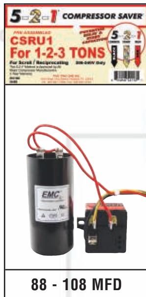
CSRU1 For 1-2-3 Tons For Scroll/Reciprocating