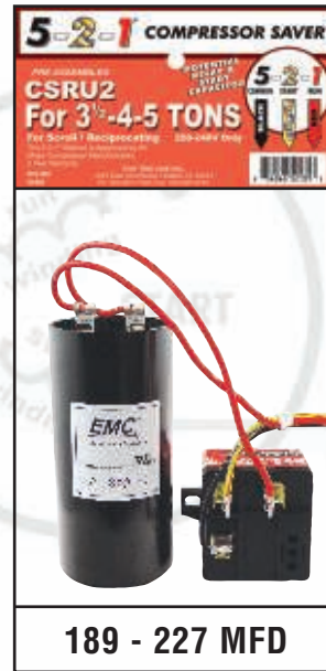
CSRU2 For 3 1/2-4-5 Tons For Scroll/Reciprocating